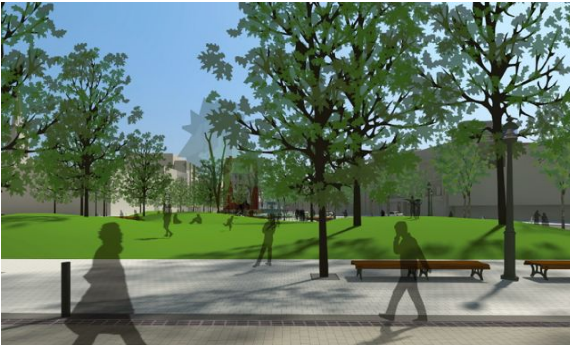
Public Art Site and Children's Play Area

The City of Toronto's Parks, Forestry & Recreation division is completing a revitalization of Berczy Park, a wedge-shaped 0.33 hectare park located in the heart of the St. Lawrence Market Neighbourhood (Ward 28, Toronto Centre-Rosedale). Renowned Montreal-based landscape architect, Claude Cormier + Associés, is charged with its redesign.